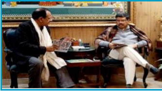
Sh. Dharmendra Pradhan, Union Minister of Skill Development & Entrepreneurship