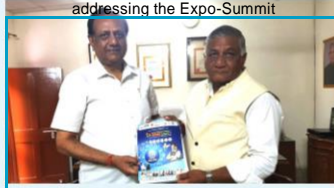
General Vijay Kumar, Union Minister (MSO), Ministry of Road Transport & Highways