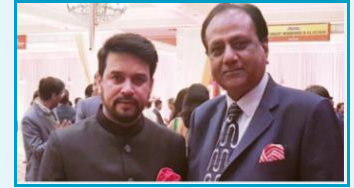
Sh. Anurag Thakur, Union Minister of I&B, Youth Affairs & Sports