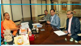
Sh. Yogi Adityanath, Chief Minister of Uttar Pradesh