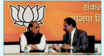
Sh. Rajnath Singh, Union Defence Minister