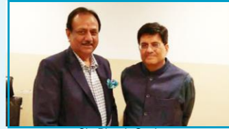
Sh. Piyush Goel, Union Minister of Commerce, Industry, Textiles & Consumer Affairs