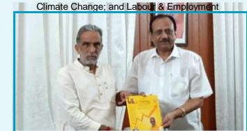
Shri Krishan Pal Gurjar, MOS-Heavy Industries & Public Enterprises & Power