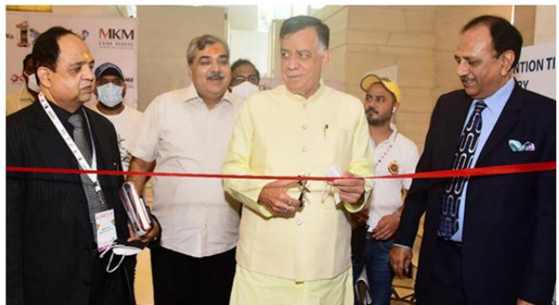
Sh. Satish Mahana, Industry Minister, U.P.