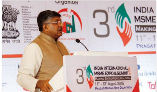
Sh. Ravi Shankar Prasad, Union Cabinet Minister for I.T, ITEs, Electronics & Law, deliberating on Ease of doing business policies & new opportunities in India