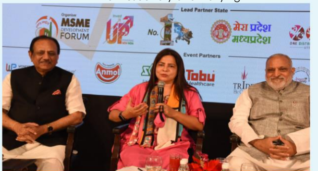
Smt. Meenakshi Lekhi, Minister of State for External Affairs and Culture