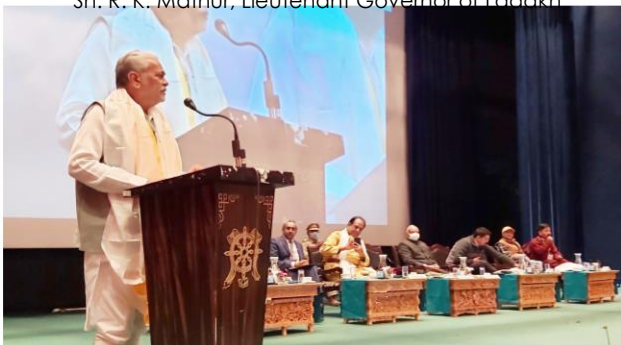
Sh. Parshottam Rupala, Minister of Fisheries, Animal Husbandry and Dairying