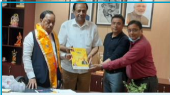
Sh. Narayan Rane, Union Minister of MSME