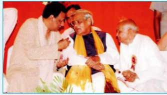
Sh. Atal Bihari Vajpayee Former Prime Minister of India