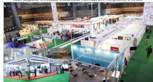
Aerial View of MSME Expo - 2014