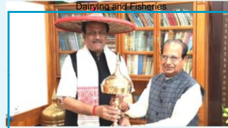
Sh. Jagdish Mukhi, Governor of Assam