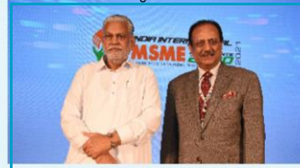
Sh. Parshottam Rupala Union Minister of Animal Husbandry, Dairying & Fisheries