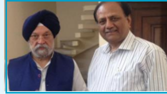
Sh. Hardeep Singh Puri Minister of Panchayats & National Gas