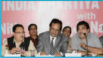
Sh. Nitin Gadkari, Union Minister of Road Transport & Highways