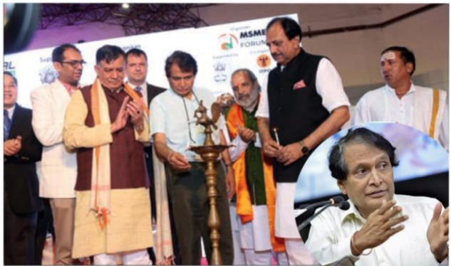
Sh. Suresh Prabhu, Union Minister of Railways, Commerce & Industry with Sh. Satish Mahana, Industry Minister, UP & Sh. Jai Bhagwan Goel Inaugurating 5th Expo