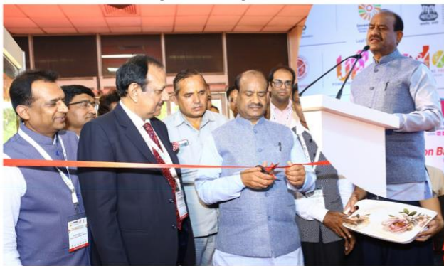
Sh. Om Birla, Speaker of Indian Parliament