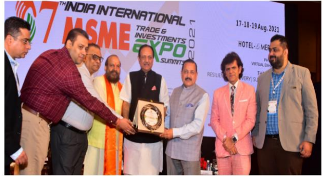
Dr. Jitender Singh Union Minister (MOS) Prime Ministers Office (PMO)

17-18-19 AUGUST 2021, HOTEL LE MERIDIEN, DELHI