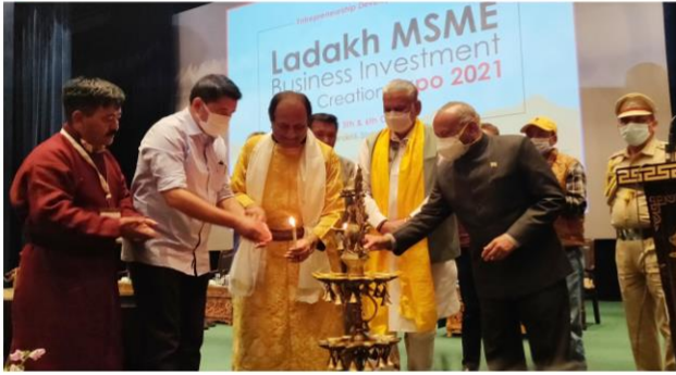
Sh. Parshottam Rupala, Minister of Fisheries, Animal Husbandry and Dairying Sh. R. K. Mathur, Lieutenant Governor of Ladakh