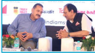
Dr. Jitender Singh Union Minister (MOS) Prime Ministers Office (PMO)