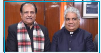
Sh. Bhupender Yadav Union Cabinet Minister for Environment, Forest & Climate Change, Labour & Employment