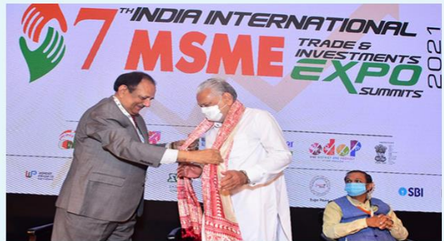
Shri Parshottam Rupala, Minister of Fisheries, Animal Husbandry and Dairying