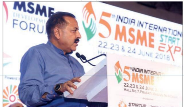
Dr. Jitender Singh, Union Minister (MSO) Prime Minister Office (PMO) & DONAR