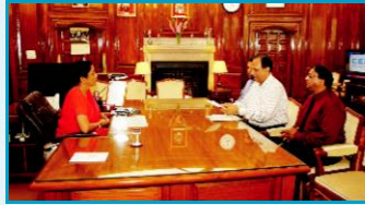
Smt. Nirmala Sitharaman, Union Finance Minister