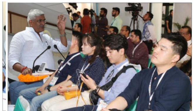
Sh. Gajendra Singh Shekhawat, Union Cabinet Minister of Jal Shakti (Water Resources) With Foreign Delegates, delivering Keynote address on opportunities in Water Resources Management in India