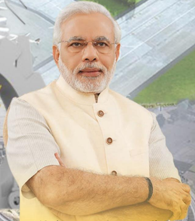
Shri Narendra Modi Hon'ble Prime Minister of India

B2G/B2B MEETS - NETWORKING NEW OPPORTUNITIES