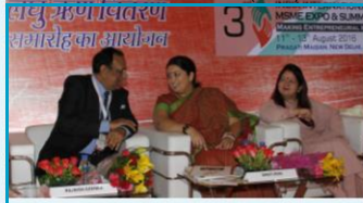
Smt. Smriti Irani, Minister of Women & Child Development addressing the Expo-Summit