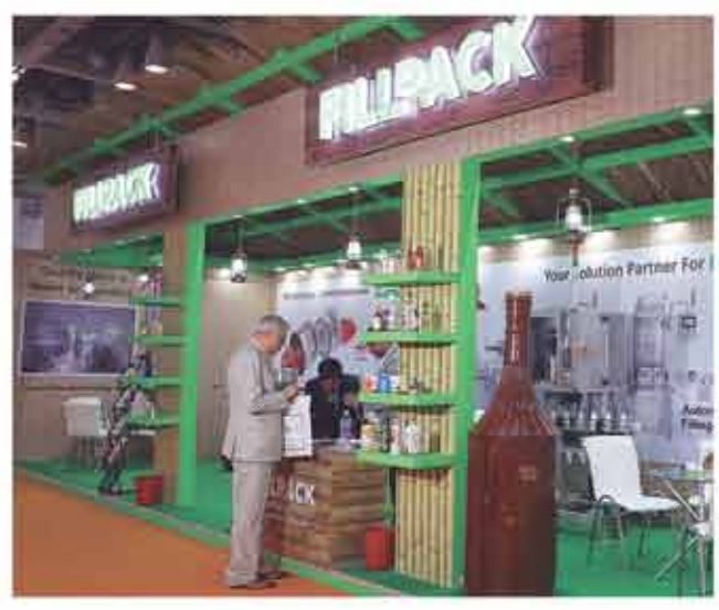
For more picture please visit our site: www.indusfood.co.in